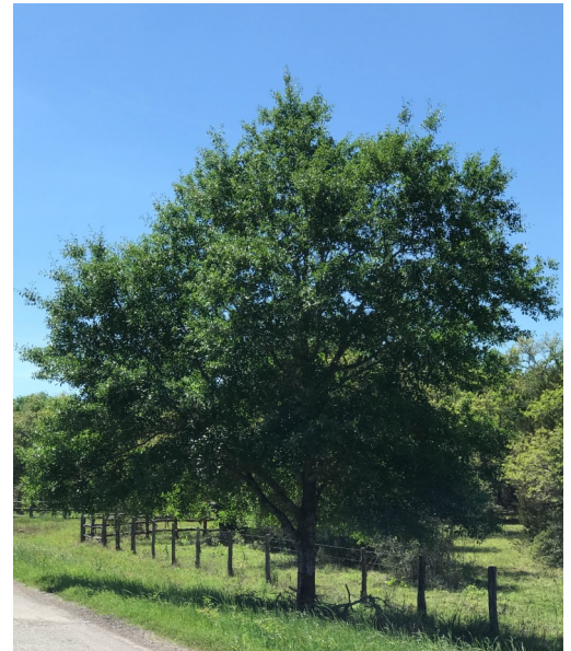
Oakridge Ranch Spring Afternoon

As stated above, elections are currently scheduled for June 6, 2020 at 10 AM. This meeting date is pending any state & federal orders concerning COVID-19 in place at that time.