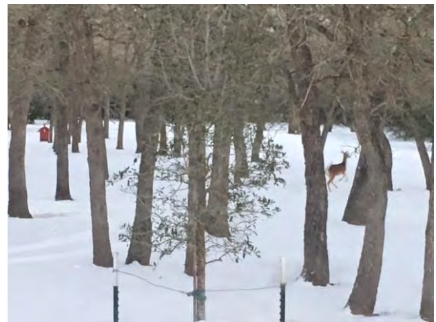
Winter Visitor

Hummingbird Nectar Recipe 1 part sugar to 4 parts water Example: 1/2 Cup sugar + 2 Cups water They do not need food coloring. If you hang the feeders, hummers will come! Enjoy!