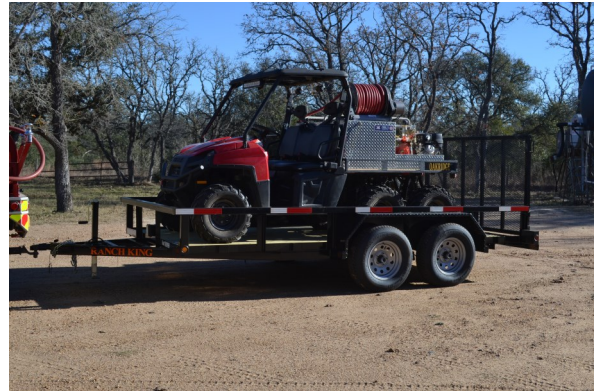
1073 Polaris fully-equipped on trailer