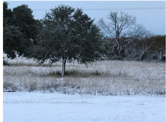
2017 December Snow & Winter Sunset

ORIA Board Meetings are held the 2nd Sunday of each month (except December) at 2 PM at the Oakridge Community Center. Meetings are open to all Oakridge landowners and you are encouraged to attend.