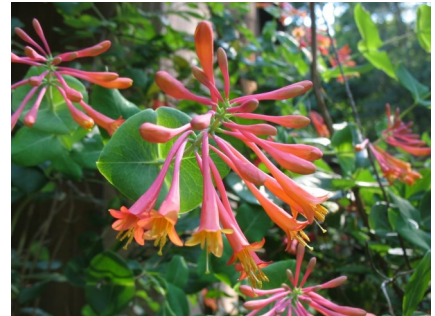
Coral Honeysuckle, native to North America, growing at Oakridge Ranch Scientific name: Lonicera sempervirens

Neighborhood Night Out October 7th, 5 to 7 PM Oakridge Ranch Community Center Sponsored by ORIA Neighborhood Watch & Security Committee