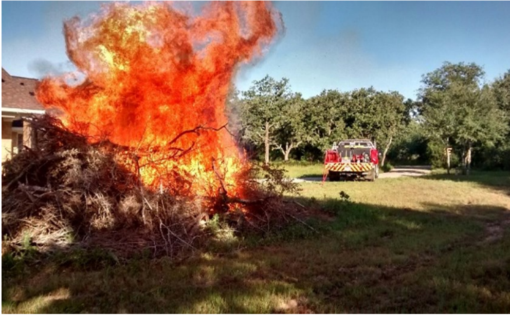
Controlled burn on Oakridge Ranch this Spring with Firefighters and Unit 1043 standing by.