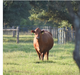
The Peacefulness of Oakridge Ranch