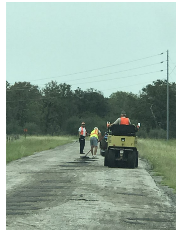
ORIA Road crew hard at work. Thanks to the many volunteers who answer when called upon!